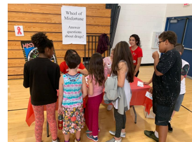
Students play the "Wheel of Misfortune" to learn about the negative consequences in taking