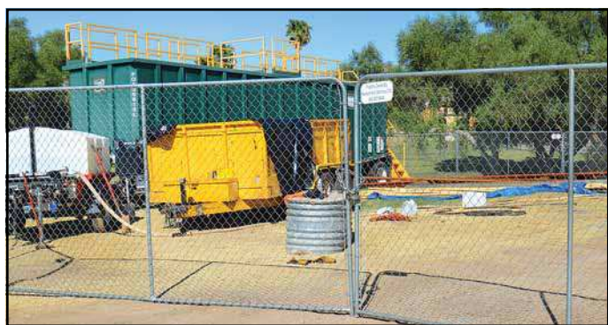
Crews have been working at the Sanitary District waste water recovery wells in Fountain Park this summer.